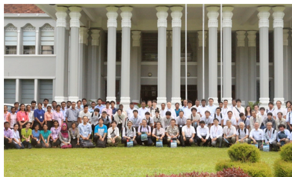
Fig.2 Technical Visit to University of Peradeniya, Sri Lanka