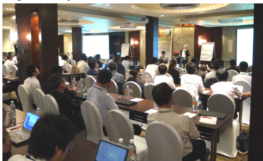
Fig.1 Opening Session of APSITT2015 in Sri Lanka